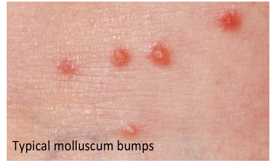
Typical molluscum bumps