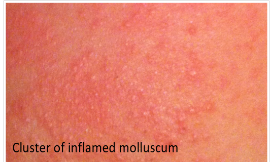
Cluster of inflamed molluscum