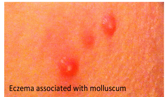
Eczema associated with molluscum